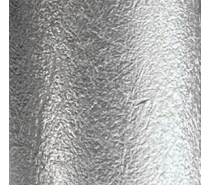
Silver Leaf - SLF